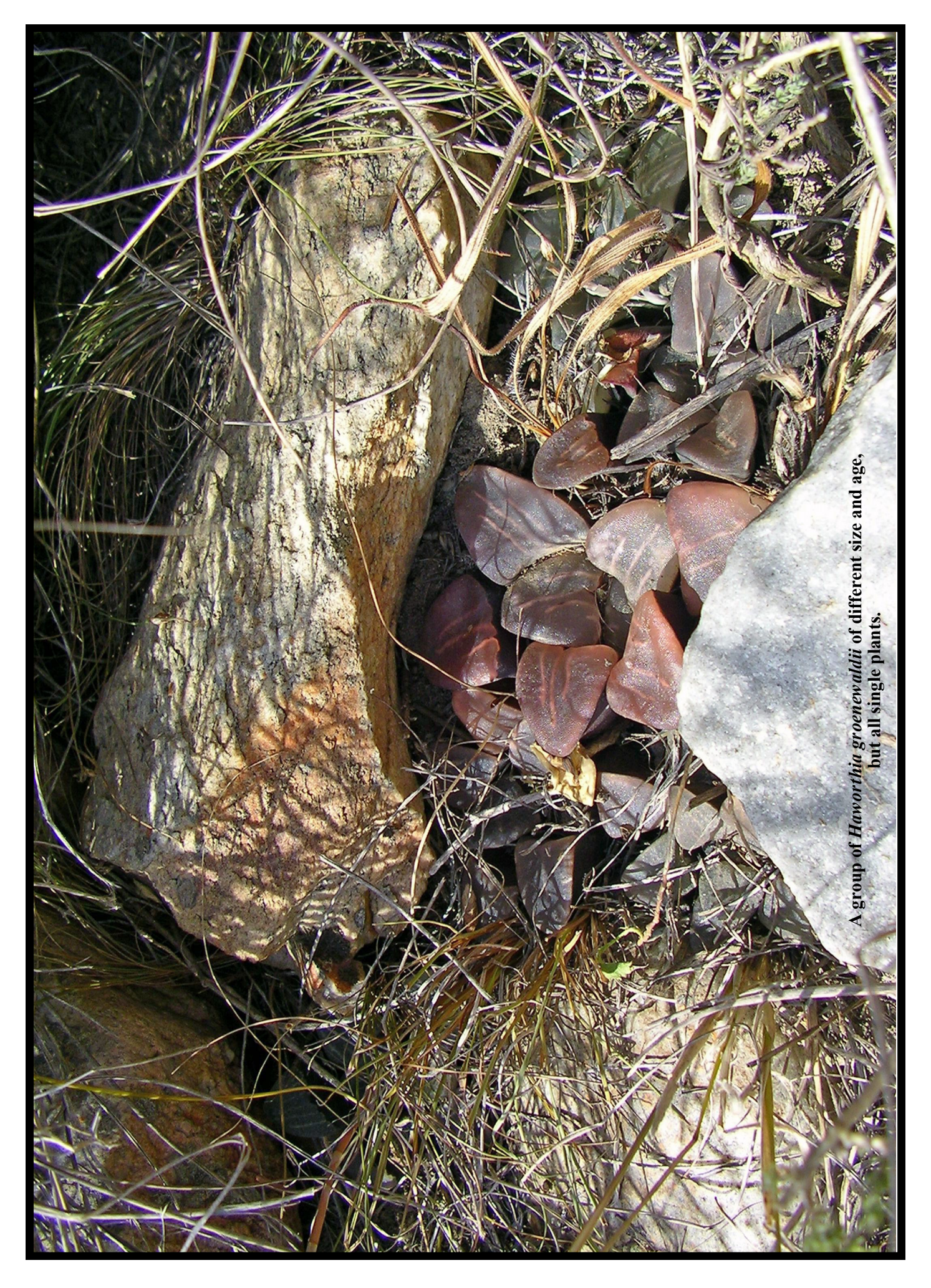
Alsterworthia International. Volume 11. Issue 2.